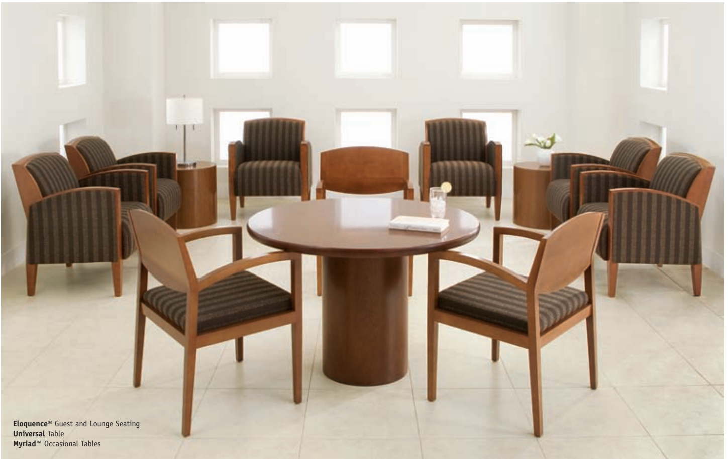
Eloquence® Guest and Lounge Seating Universal Table Myriad™ Occasional Tables