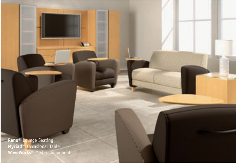
Reno® Lounge Seating Myriad™ Occasional Table WaveWorks® Media Components