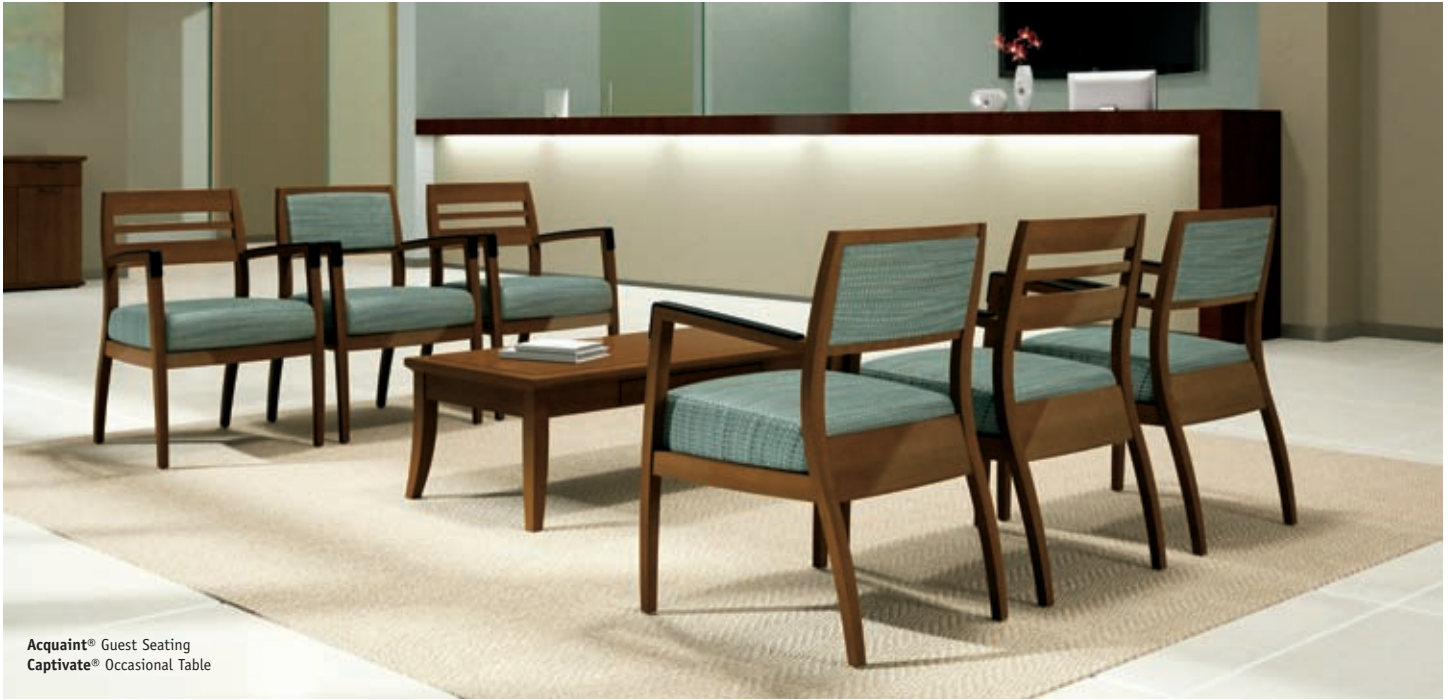
Acquaint® Guest Seating Captivate® Occasional Table