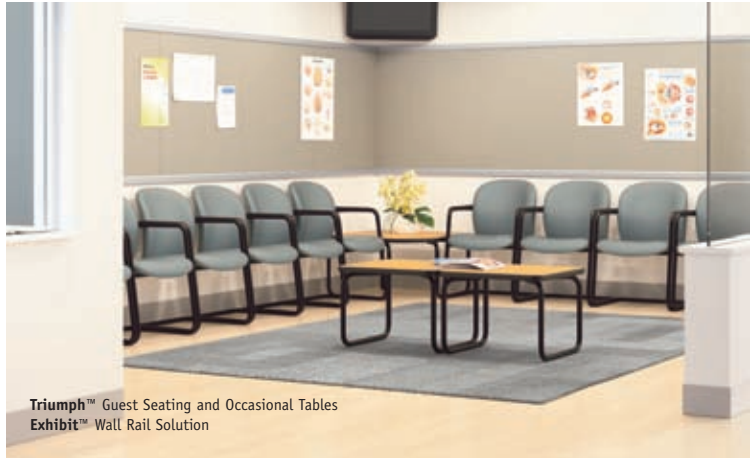
Triumph™ Guest Seating and Occasional Tables Exhibit™ Wall Rail Solution