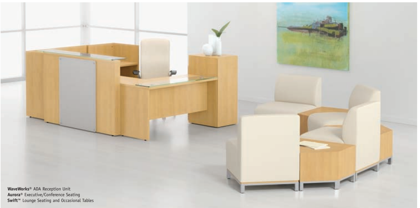
WaveWorks® ADA Reception Unit Aurora® Executive/Conference Seating Swift™ Lounge Seating and Occasional Tables