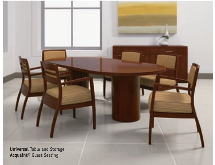
Universal Table and Storage Acquaint® Guest Seating