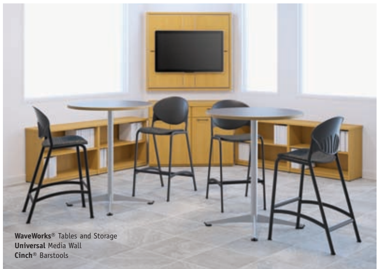
WaveWorks® Tables and Storage Universal Media Wall Cinch® Barstools