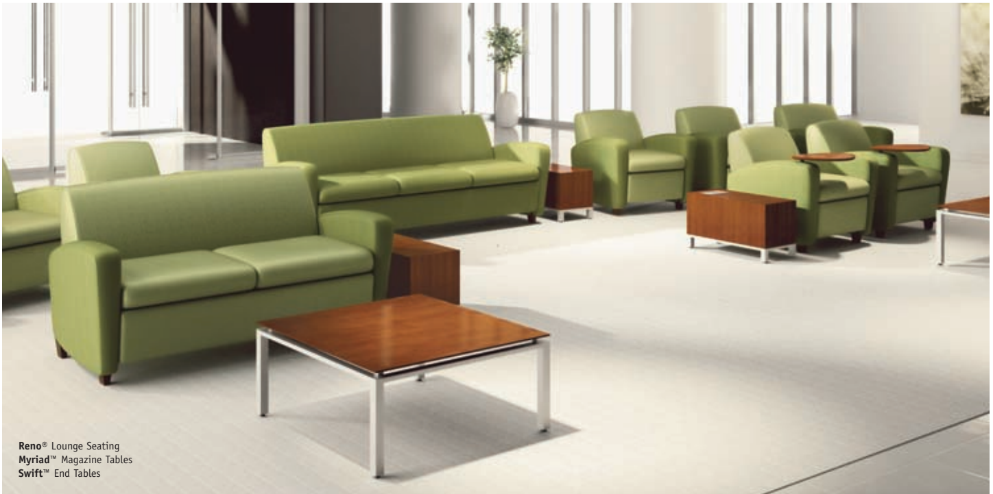
Reno® Lounge Seating Myriad™ Magazine Tables Swift™ End Tables