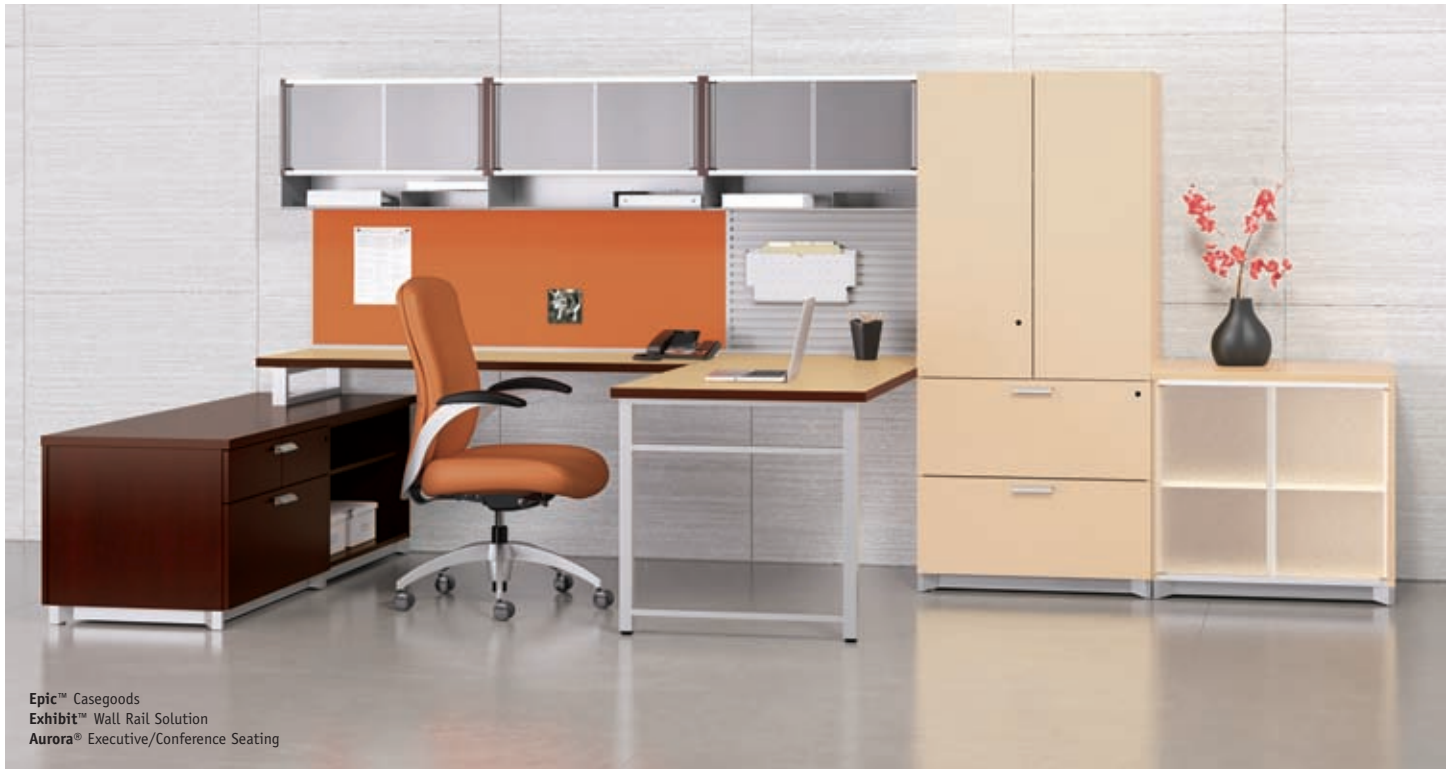
Epic™ Caseloads Exhibit™ Wall Rail Solution Aurora® Executive/Conference Seating