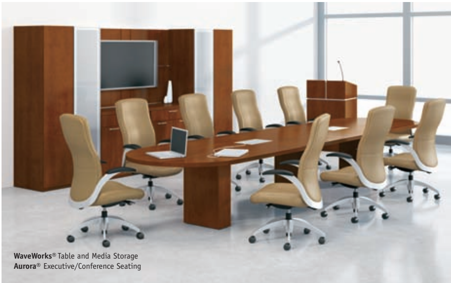
WaveWorks® Table and Media Storage Aurora® Executive/Conference Seating