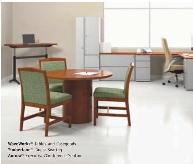
WaveWorks® Tables and Casegoods Timberlane™ Guest Seating Aurora® Executive/Conference Seating