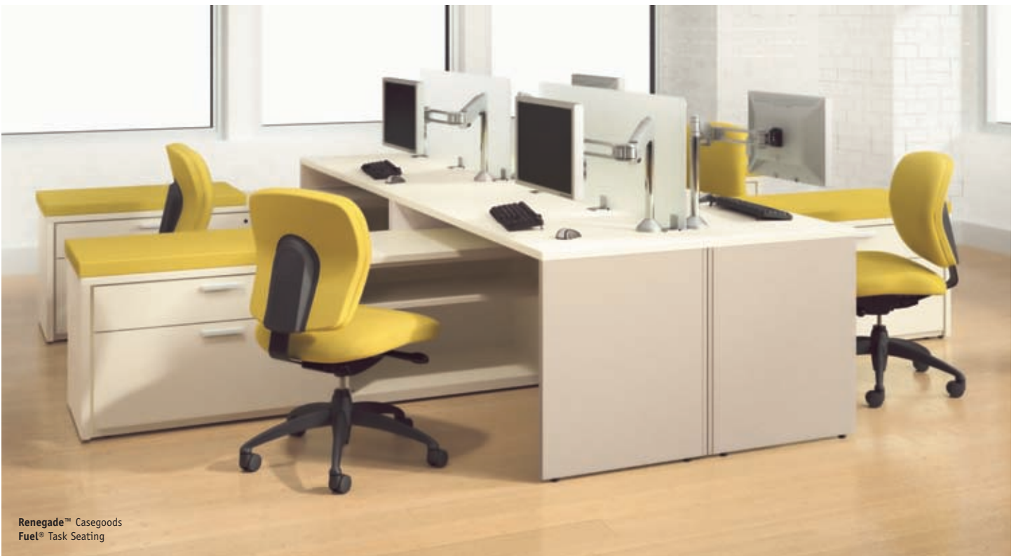
Renegade™ Caseloads Fuel® Task Seating