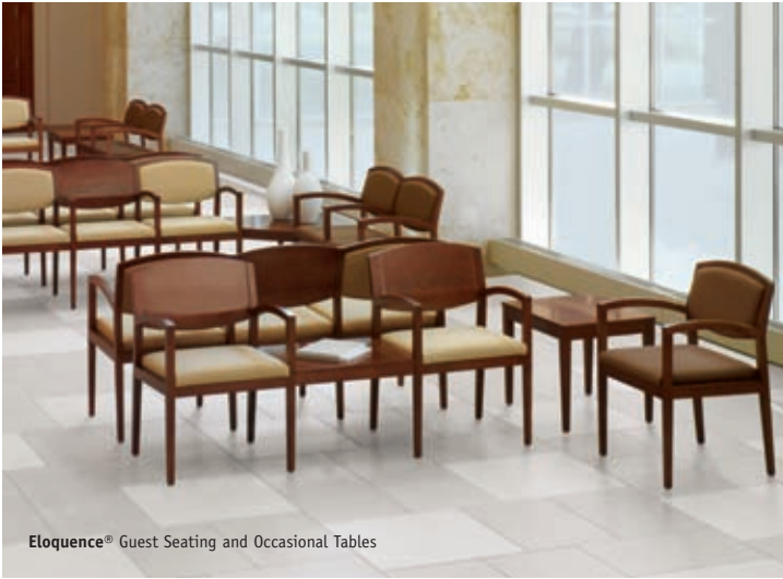
Eloquence® Guest Seating and Occasional Tables