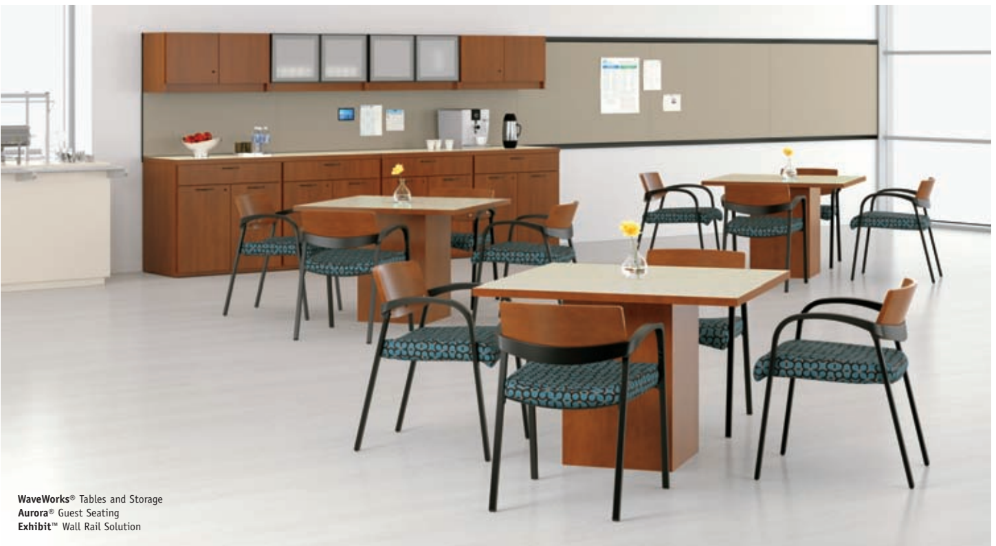
WaveWorks® Tables and Storage Aurora® Guest Seating Exhibit™ Wall Rail Solution