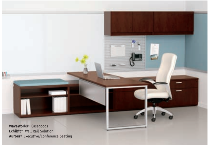
WaveWorks® Caseloads Exhibit™ Wall Rail Solution Aurora® Executive/Conference Seating