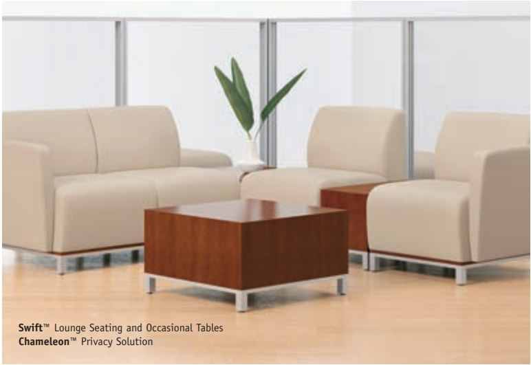
Swift™ Lounge Seating and Occasional Tables Chameleon™ Privacy Solution