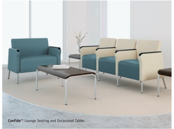
Confide™ Lounge Seating and Occasional Tables