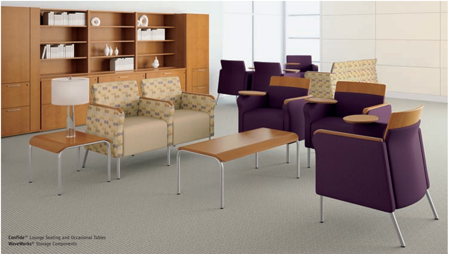
Confide™ Lounge Seating and Occasional Tables WaveWorks® Storage Components