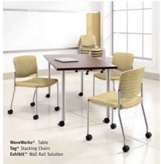
WaveWorks® Table Tag® Stacking Chairs Exhibit™ Wall Rail Solution