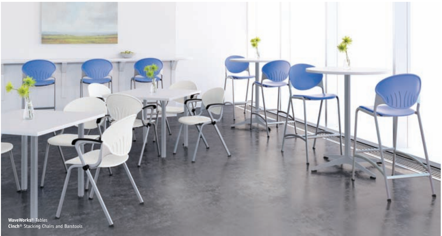
WaveWorks® Tables Cinch® Stacking Chairs and Barstools