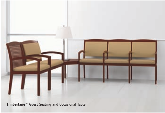
Timberlane™ Guest Seating and Occasional Table