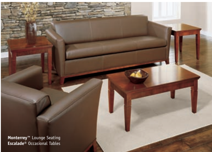
Monterrey™ Lounge Seating Escalade® Occasional Tables