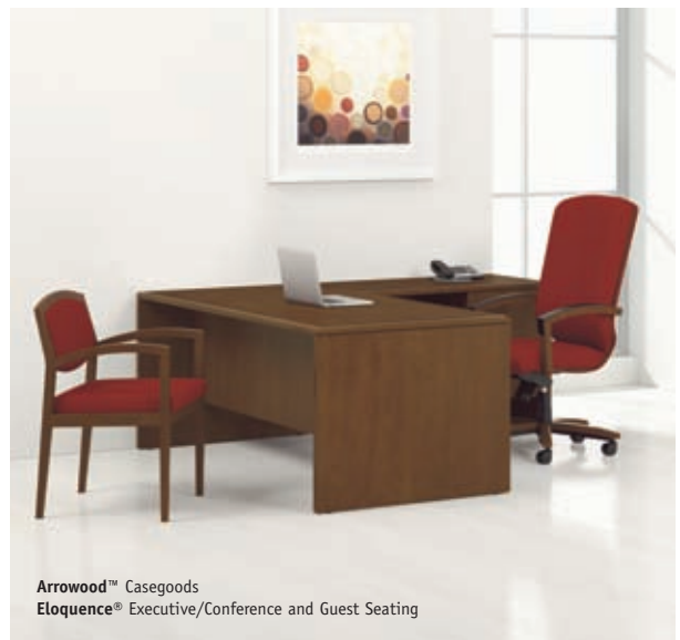
Arrowood™ Caseloads Eloquence® Executive/Conference and Guest Seating