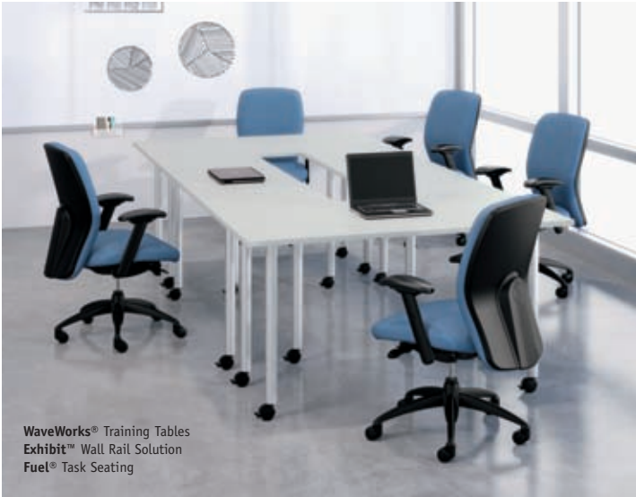
WaveWorks® Training Tables Exhibit™ Wall Rail Solution Fuel® Task Seating