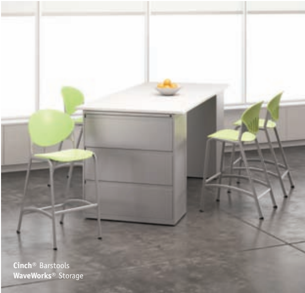
Cinch® Barstools WaveWorks® Storage