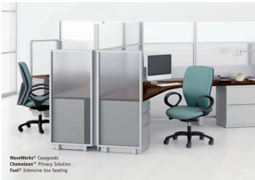
WaveWorks® Caseloads Chameleon™ Privacy Solution Fuel® Intensive Use Seating