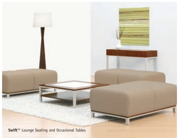
Swift™ Lounge Seating and Occasional Tables