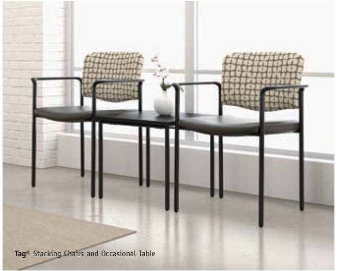
Tag® Stacking Chairs and Occasional Table