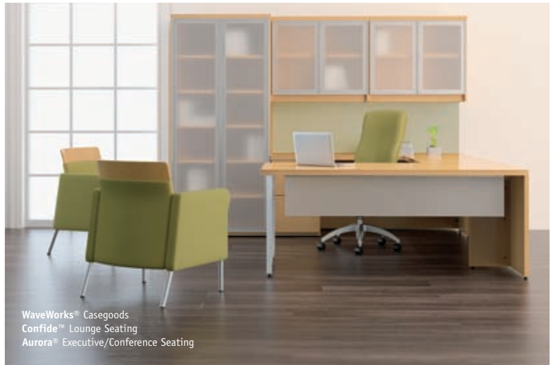
WaveWorks® Caseloads Confide™ Lounge Seating Aurora® Executive/Conference Seating