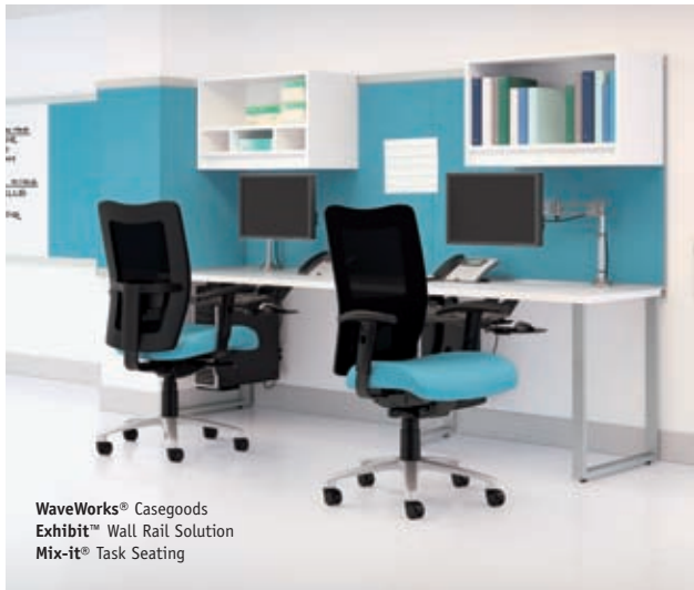
WaveWorks® Caseloads Exhibit™ Wall Rail Solution Mix-it® Task Seating