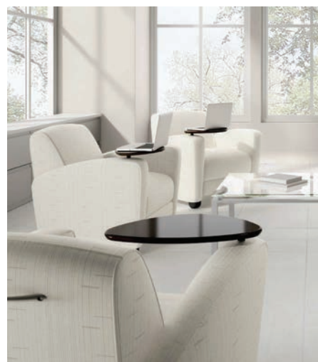
TABLET ARM SOLUTIONS

Freestanding and modular, mobile and static, wood legs and metal legs, we've got it all. Coordinate with your style and boost productivity by choosing a seating solution that offers a convenient and functional tablet arm. Tablet arms provide a surface for devices, books, and notepads, while supporting the need to be comfortable and collaborative.