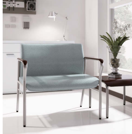
BARIATRIC SEATING SOLUTIONS

Bariatric seating from National provides confidence and peace of mind to individuals needing extra support. Choose from various styles and price points to create the right solution for your needs. Combine these bariatric solutions with their standard seating partners to create a cohesive floorplan.