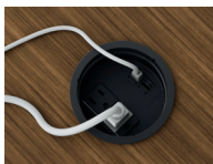
G10EL ROUND GROMMET