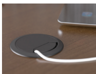
G13 ROUND GROMMET