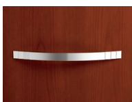
CURVED PLATINUM METALLIC