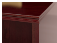
FLUTED RIM PROFILE