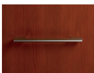
ELONGATED PLATINUM METALLIC