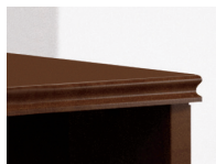
VENEER CHASSIS WITH LAMINATE TOP