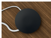
G10 ROUND GROMMET